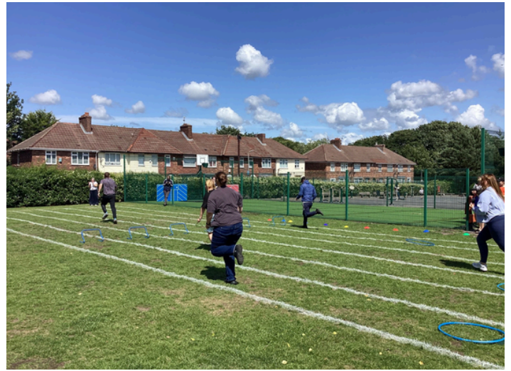
EYFS Sports Day