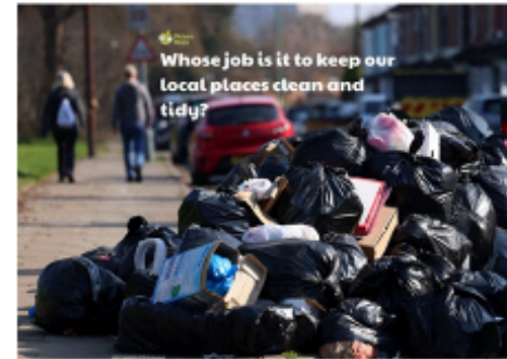
Whose job is it to keep our local places clean and tidy?

Every child has the right to a clean and safe environment. When rubbish piles up, it can affect children's health and safety. Governments should work to solve problems quickly, so that children have clean places to grow up.