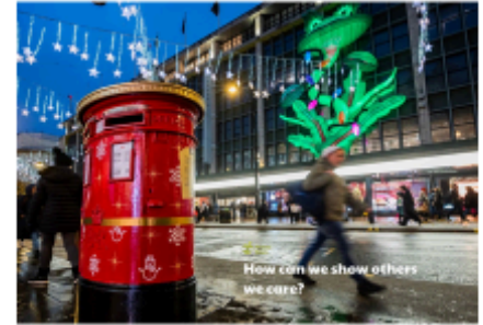
How can we show others we care?

We can choose our own thoughts, opinions and religion. These may impact if and how we choose to celebrate Christmas.