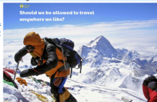
Should we be allowed to travel anywhere we like?

https://www.bbc.co.uk/news/articles/cd0jlp3ll88o