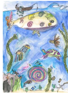
Beautiful Breathing Ocean

Mia Drury Water Colour Pencils, 30cm x 21cm