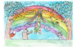
Powerful Plastic Pull

Emma Danca Water Colour Pencils, 30cm x 21cm