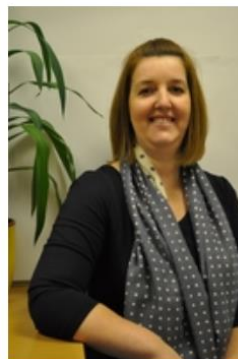
Deputy Head & Safeguarding Lead and EYFS Lead