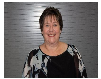
Nursery nurse (reception)