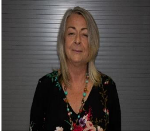
Nursery nurse (reception)