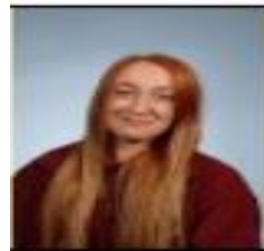
Teaching assistant (Nursery)