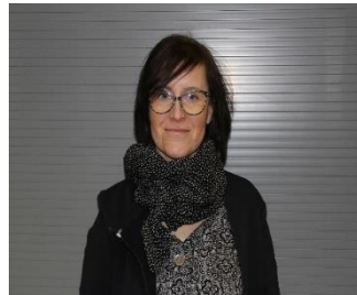
Teaching assistant (Nursery)