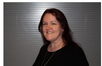
SENCO and Assistant Head teacher