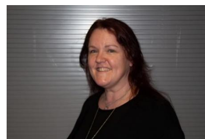
SENCO and Assistant Head teacher