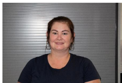
Learning support assistant