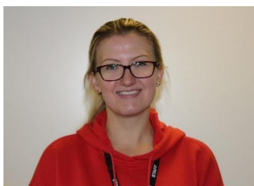
Learning support assistant