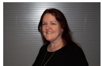
SENCO and Assistant Head teacher