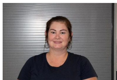
Learning support assistant